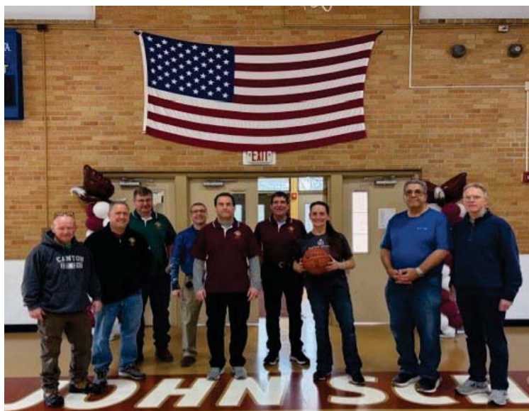
Knights of Columbus Event Volunteers