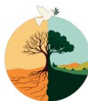
Garden of Peace Isaiah 32:14-18

May this Season of Creation be a time of renewed awareness, deeper faith, and bold love—for Creation, for justice, and for one another.