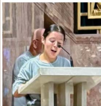
Kayla Walsh Building in Kentucky