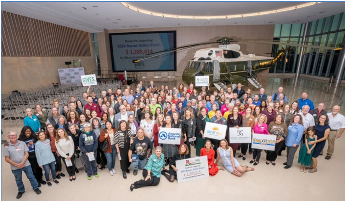
2024 Brazos Valley Gives Celebration of Community Philanthropy – Nov. 2024

Remember: A matching fund does not have to be from just one source. Perhaps a combination of partners could come together to create a matching fund and work together on behalf of your mission!