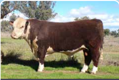
LOT 1 TYCOLAH YANKEE V053