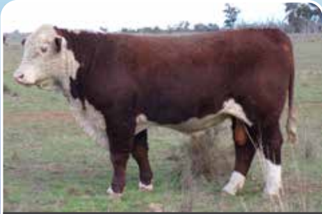
LOT 14 TYCOLAH YARN V064