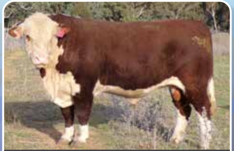
LOT 15 TYCOLAH YACKA V025