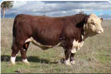
LOT 34 TYCOLAH YAWN V062