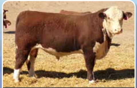
LOT 37 TYCOLAH YAKOVA V163