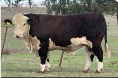
LOT 21 COTTAGE V005