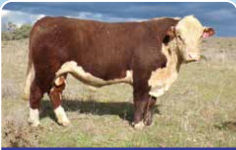
LOT 29 TYCOLAH YEARWOOD V047