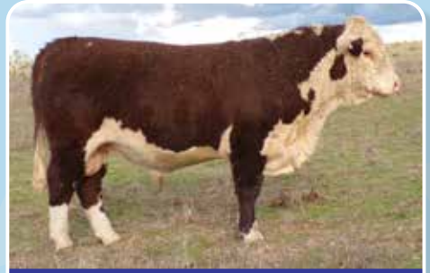
LOT 31 TYCOLAH YAMBA V186