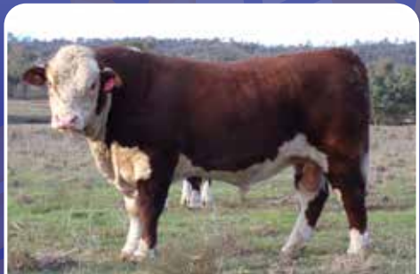
LOT 9 TYCOLAH YARRA V038