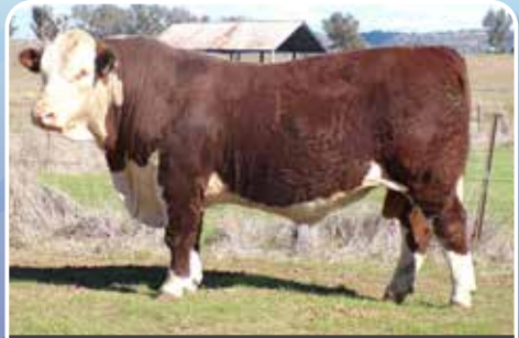
LOT 6 TYCOLAH YABUZUKA