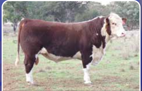
LOT 24 TYCOLAH YEDDA V097