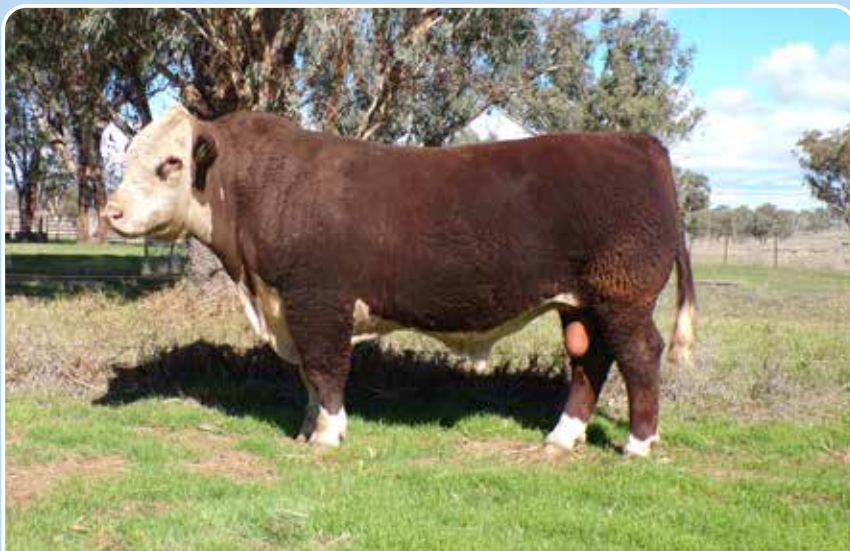
Lot 2 TYCOLAH YARDSMAN V052