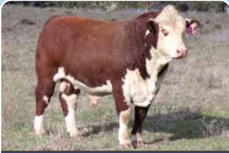
LOT 18 TYCOLAH YANKO V079