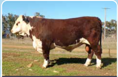
LOT 4 TYCOLAH YEOMAN V124