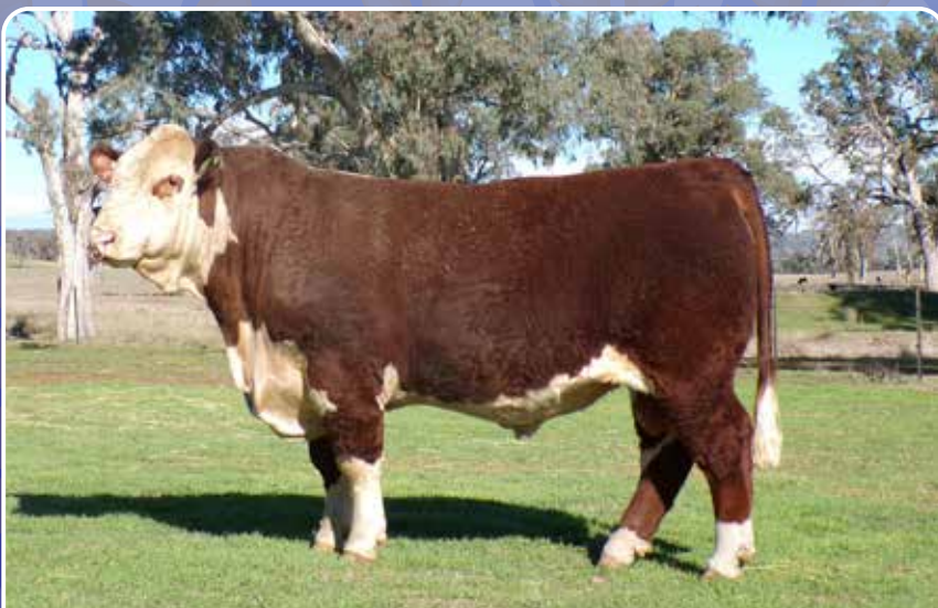
Lot 3 TYCOLAH YARDSTICK V114