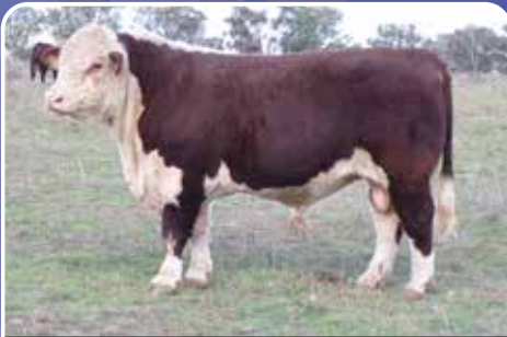
LOT 16 TYCOLAH YO YO V109