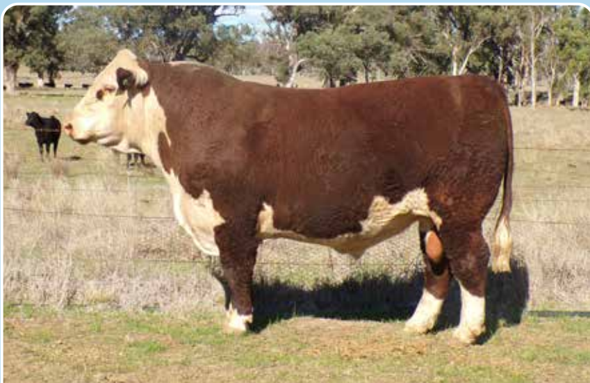
Lot 7 TYCOLAH YAZIR V172