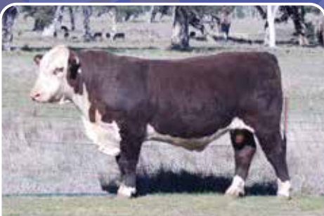
LOT 8 TYCOLAH YEARNING V175