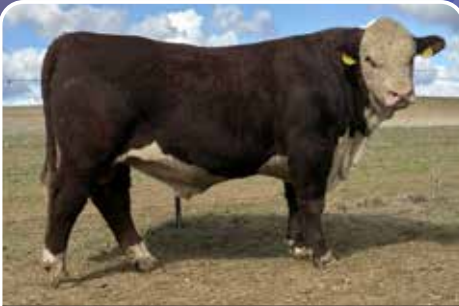
LOT 23 COTTAGE ANZAC V003