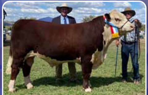
TYCOLAH UNDERCOVER S117