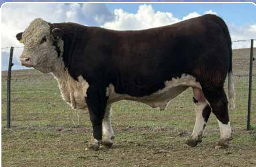
Lot 20 COTTAGE PACIFIER V006