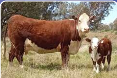
DAM OF LOT 26 TYCOLAH URSULA M106