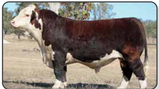
Tycolah Queenscliff N029

I think we will hear more of his influence in the future and is one of our major building blocks of our breeding program beginning with Tycolah Undercover S117 whose sons feature in this sale. Undercover was 2024 Sydney RAS Res Junior Champion Bull.