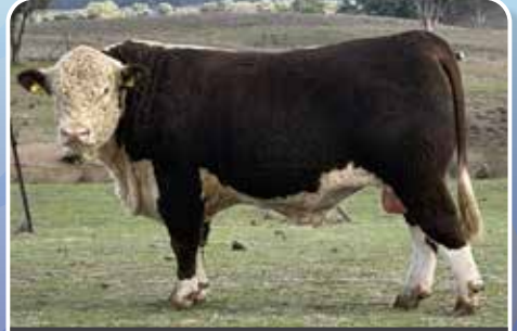
LOT 22 COTTAGE LOGAN V017