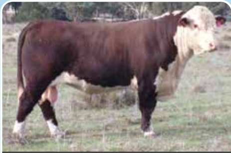
LOT 10 TYCOLAH YARRAN V032