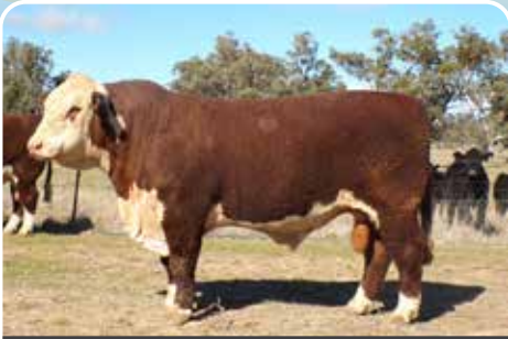
LOT 5 TYCOLAH YARRAMAN V101