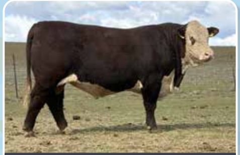
LOT 19 COTTAGE SOPRANO V023