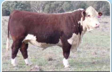
LOT 11 TYCOLAH YUKON V084