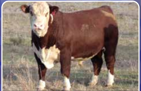
LOT 17 TYCOLAH YARDARM V078