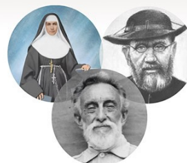
He served where saints walked.