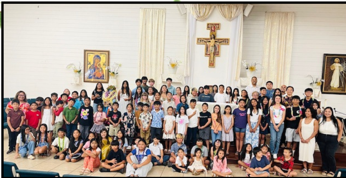
Last day of Religious Education classes on May 17, 2026. Picture taken after the crowning of the Blessed Mother.