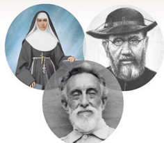
He served where saints walked.

Joseph Dutton gave 44 years of his life serving those with Hansen's Disease in Moloka'i alongside Saint Damien and Saint Marianne Cope