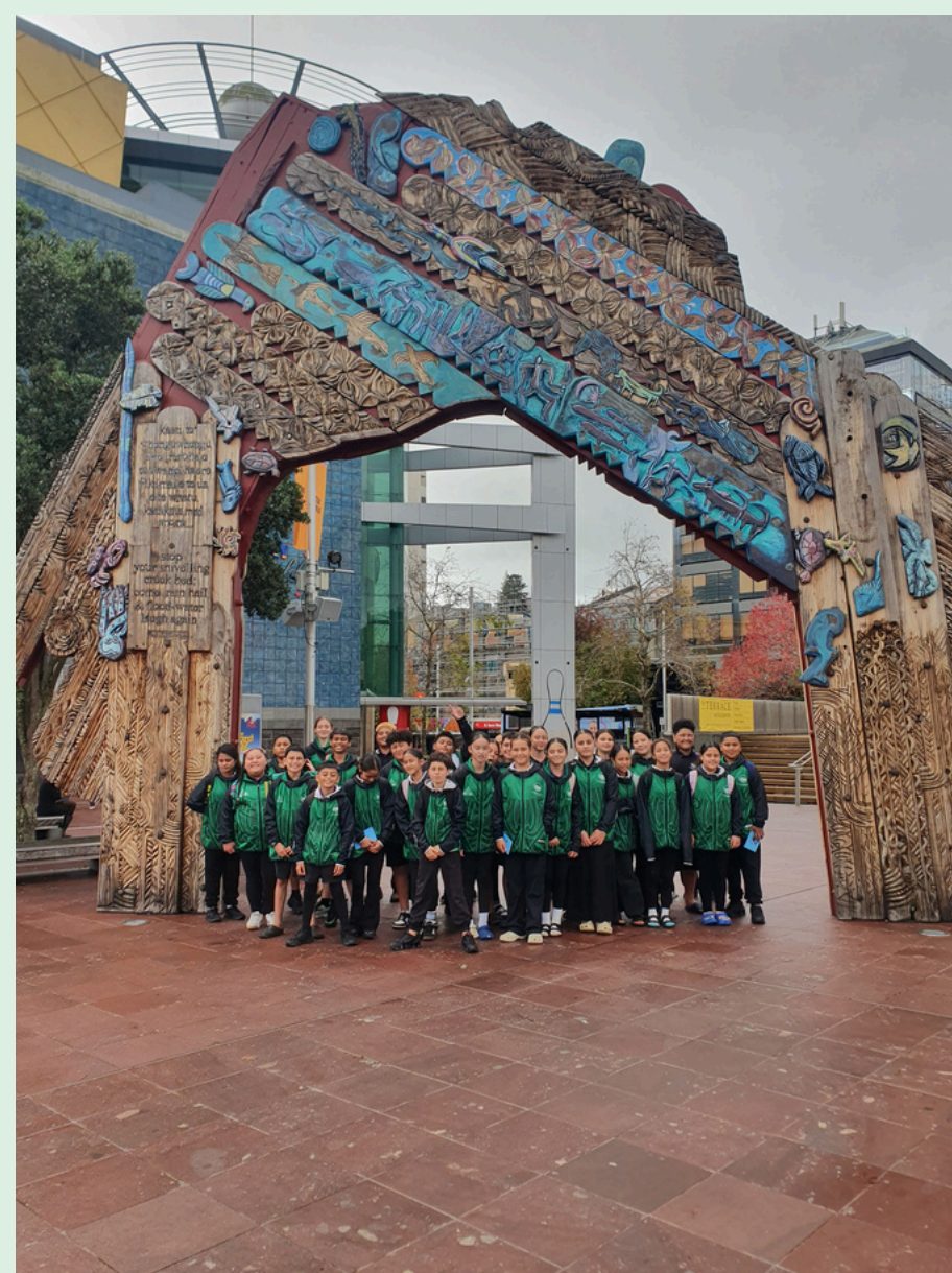
I tae atu mātau o Hinoi ki Tāmaki Makaurau ki te tautoko i Te Ahurei Tuhituhi.

Me mihi ka tika ki tena, ki tena o koutou i tautoko, i whakanui i ta matou toa hokohoko. Harihari katoa nga tamariki ki te kai i nga kai hukahuka.