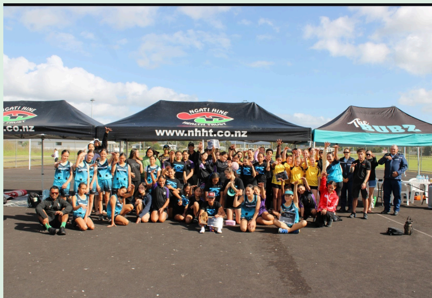
Te Punga o Taumarere Netipaora

I haere wetahi o nga tamariki o Hinoi ki te tautoko i te ra Netipaora o Te Punga o Taumarere. I tuatoru nga tamariki i taua ra.