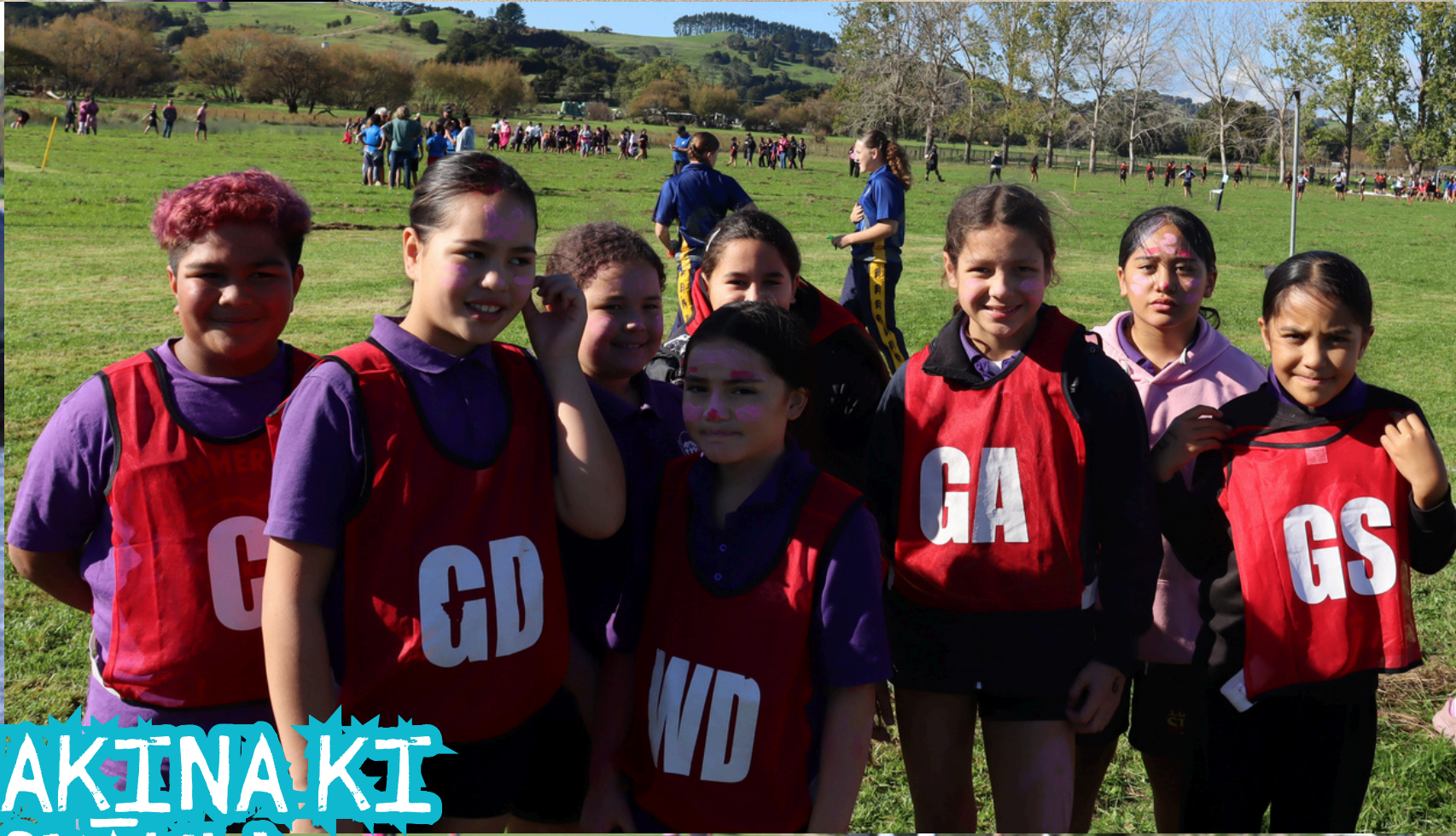
RA HĀKINAKINA KI MAROMĀKU