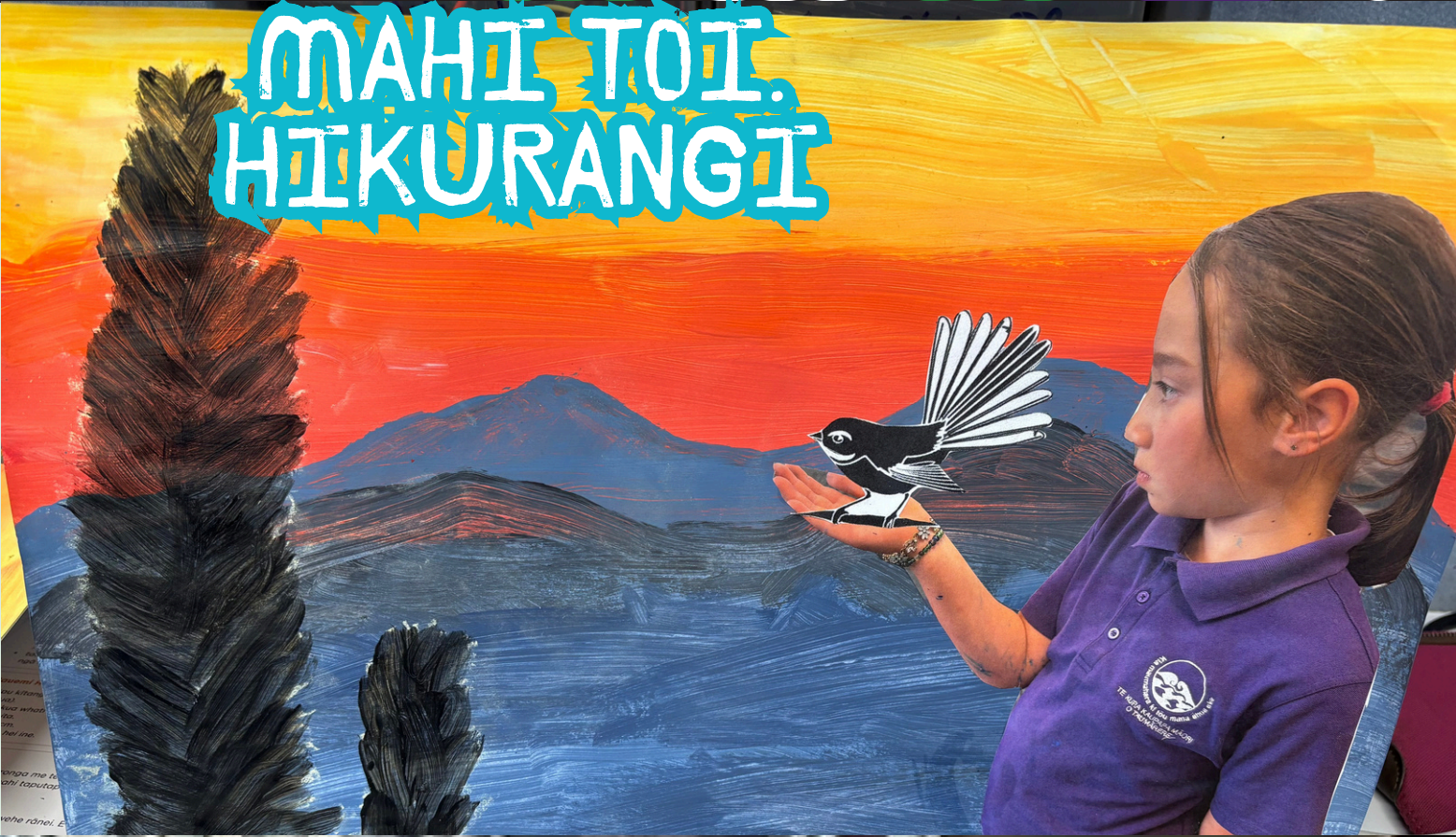
MAHI TOI HIKURANGI