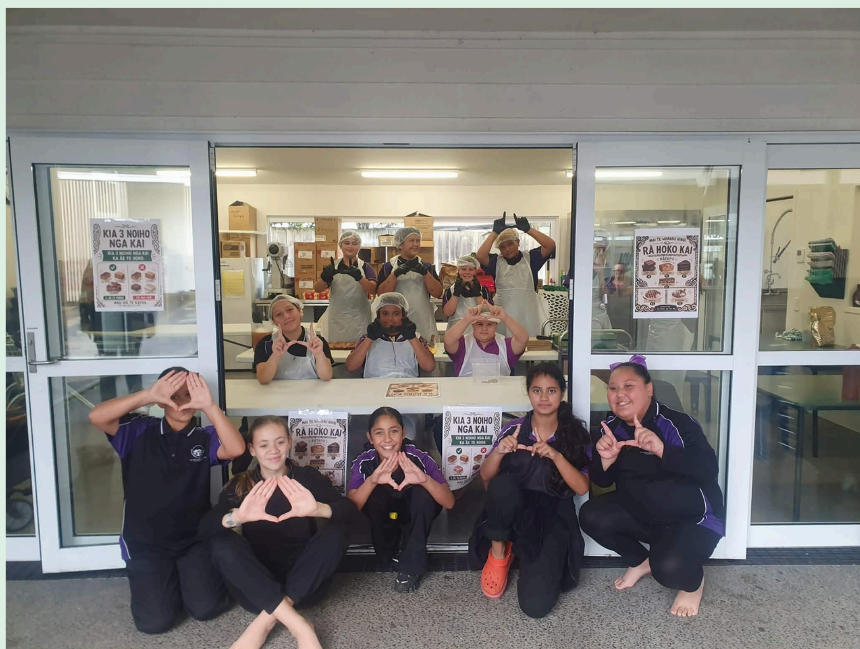
Toa Hokohoko Penapena Putea

Me mihi ka tika ki tena, ki tena o koutou i tautoko, i whakanui i ta matou toa hokohoko. Harihari katoa nga tamariki ki te kai i nga kai hukahuka.