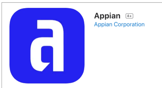
Figure 1: Apple App Store app

RightCareHQ is built and hosted on a platform called Appiancloud. On the Apple App Store or Google Play Store, search for the free app called "Appian". The app shows a large, white coloured 'a' on a blue background.