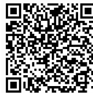
Gran Gala Dinner

It is strictly forbidden to occupy positions other than those indicated on the invitation. Violators will be invited to move and occupy the places assigned to them.