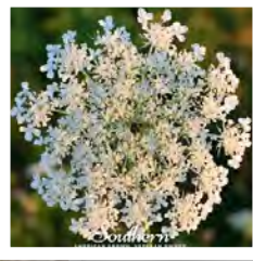
Queen Anne's Lace