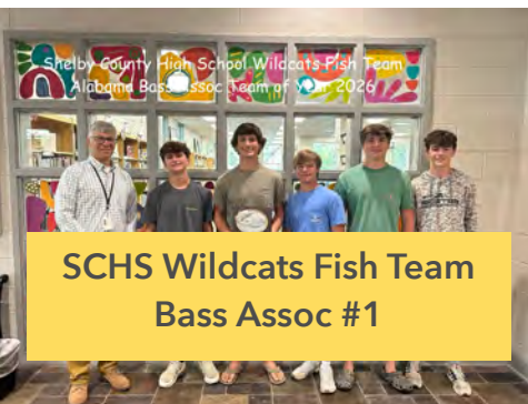
SCHS Wildcats Fish Team Bass Assoc #1