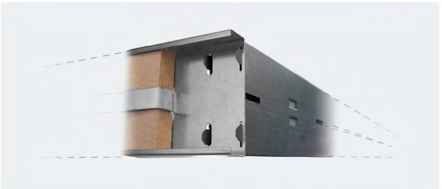
ACCOPIAMENTO TRAVERSA + FIANCATA