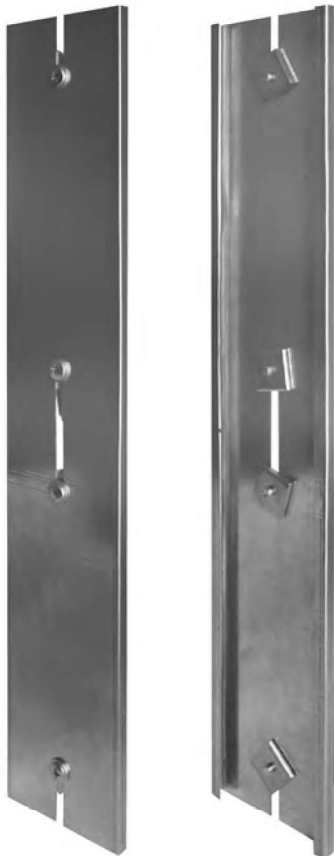
STAFFA DI GIUNZIONE