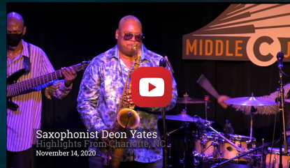
Middle C Charlotte, NC