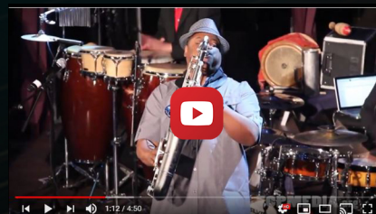
Masonic Temple Detroit, MI