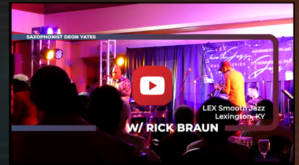
Lex Smooth Jazz w/Rick Braun