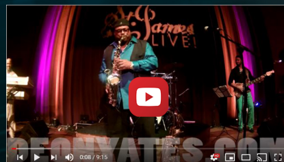
St. James Live Atlanta, GA

Phi Beta Sigma Conclave, Detroit, MI Capital Jazz Supercruise, Caribbean Gulf Coast Jazz Festival, FL Masonic Temple, Detroit, MI Blues Alley Washington, DC Arizona Jazz Festival Phoenix, AZ St. James Live Atlanta, GA Spaghetini Seal Beach, CA Capital Jazz Festival Columbia, MD Jazz Legacy Foundation Hampton, VA GrandJazzFest Grand Rapids, MI Perfect Note Hoover, AL Spaghetini Beverly Hills, CA Spring Jazz & Arts Festival, FL Chayz Lounge, SC Ribs & Soul Music Festival, Detroit, MI The Velvet Note Alpharetta, GA Middle C Charlotte, NC