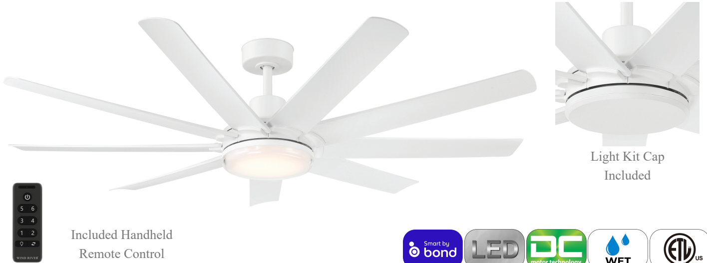
Light Kit Cap Included