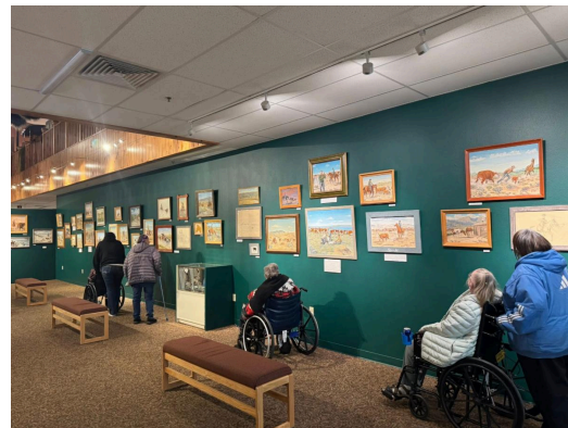
Morning Star Care Center Residents visited the Pioneer Museum in Lander Wyoming

Wyoming Retirement Center is looking for donations to have a Senior Prom. Looking for age-appropriate formal wear (dresses, skirts, dress tops, dress pants, ties, suspenders and bowties)