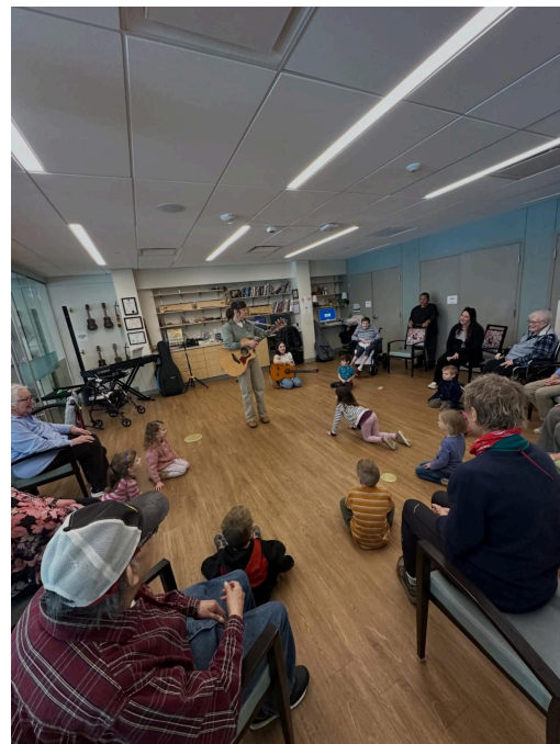
St. Johns Health Sage Living "Tunes With Tots"