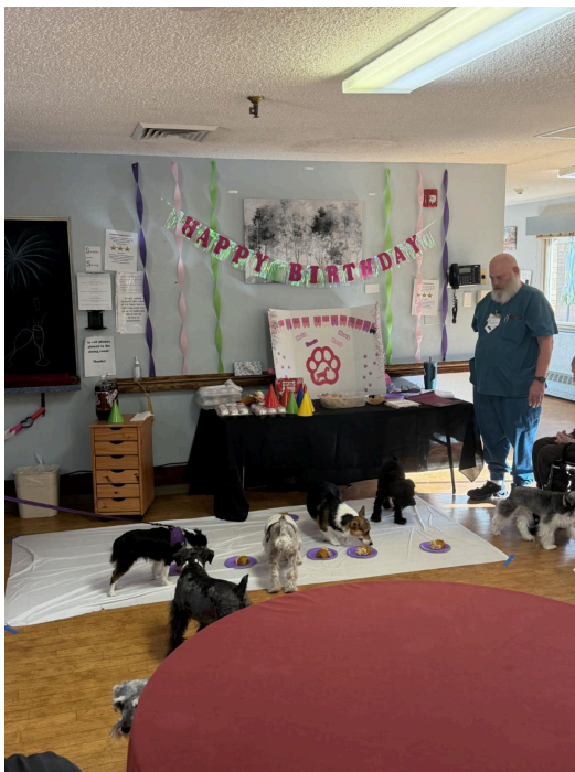
Puppy Party at Rawlins Rehab and Wellness