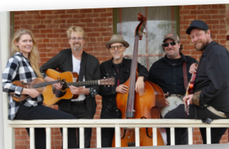
Ten Dollar Wedding

Tickets are now on sale! Get yours online at Eventbrite.com , at the Wickenburg Visitor Center, or at the gate (note: it will be cash only at the gate).