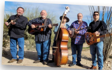
North of Lonesome