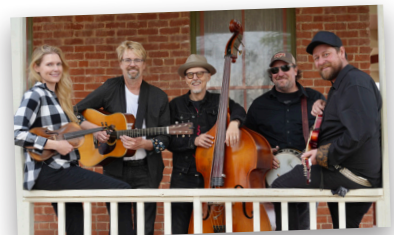
Ten Dollar Wedding

Sponsorship opportunities are available for local businesses! Promote your business and invite attendees to check out your business during the festival. Options for all budgets are available. View the sponsorship form on the Chamber website or grab a copy at the Chamber office.