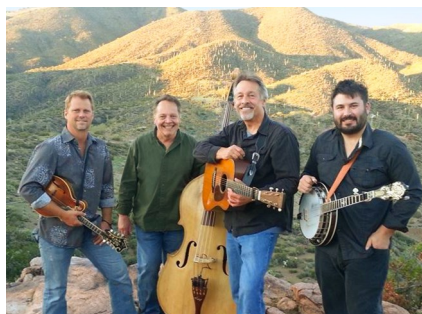
The Sonoran Dogs