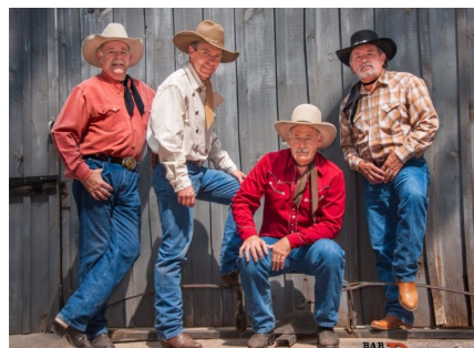
Bar D Wranglers