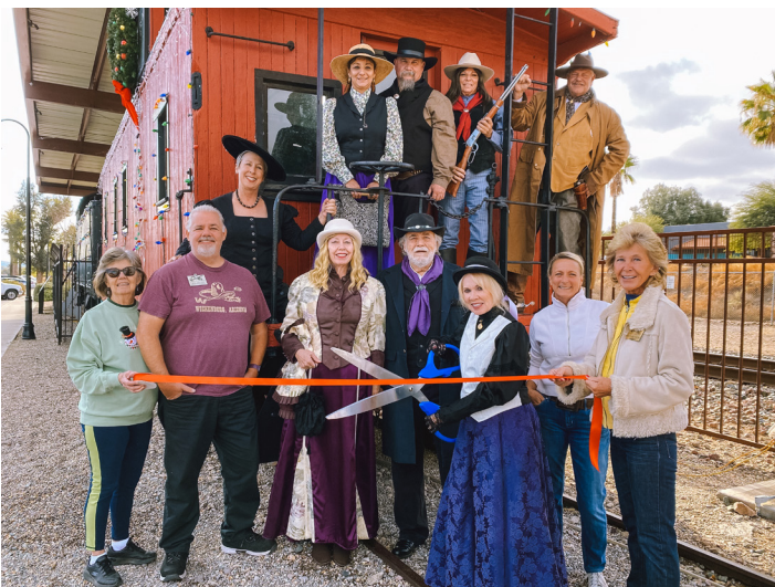
Hassayampa Ridge Riders Performers; Non-profit Organization 916-764-0726

Thank you to our presenting sponsors, Freeport McMoRan, Arizona Public Service, and Wickenburg Ranch. We'd also like to thank our breakfast sponsors, Premiere Tax & Accounting Services and Desert Cypress Mobile Home & RV Park.