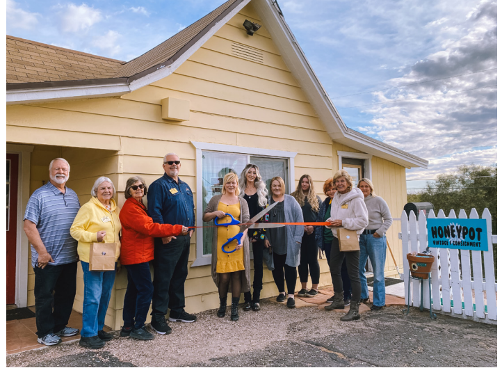
HoneyPot Vintage & Consignment Consignment Store; Thrift Store 159 W. Wickenburg Way, Wickenburg, AZ 928-277-4555 azhoneypot.com