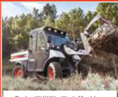
Toolcat™ Utility Work Machines