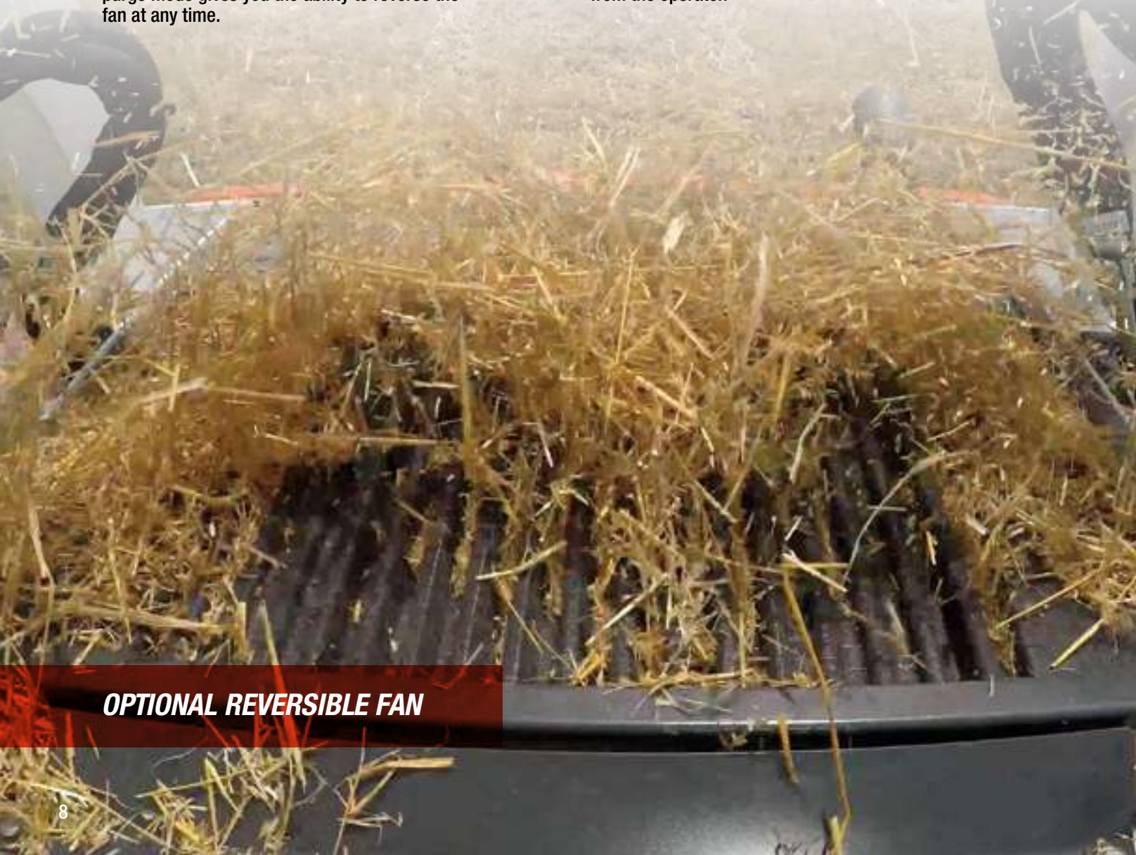
OPTIONAL REVERSIBLE FAN