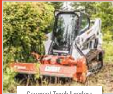
Compact Track Loaders