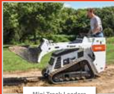
Mini Track Loaders