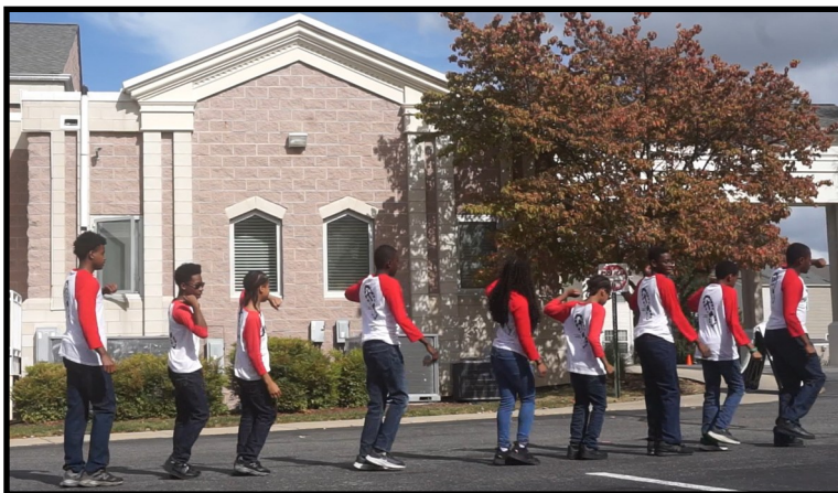
IGN In God's Name Step Team

Thank you to every one and every ministry that played a part in making these two days a great experience.