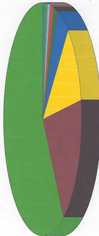
Expense Summary January through May 2025