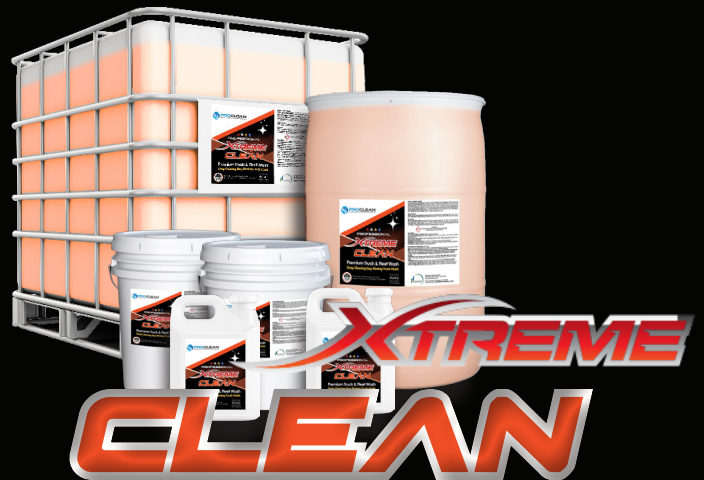
Alkaline Truck Wash Step #2