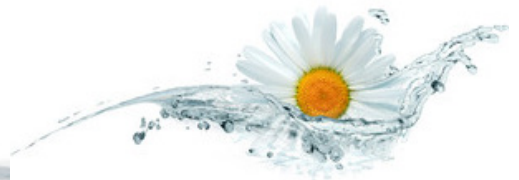
Fresh Mountain Air