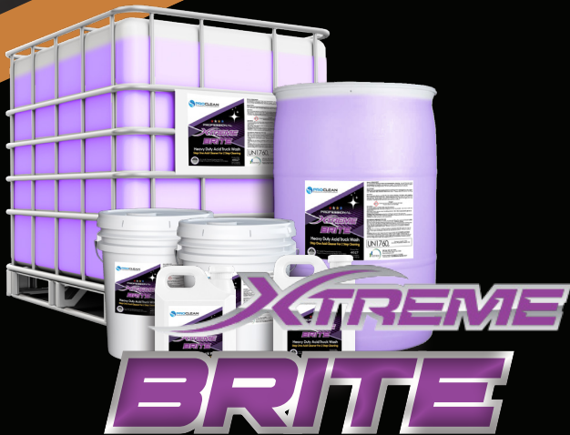
Acid Truck Wash Step #1

Makes Cleaning Easier, Faster, More Efficient! Just Spray, Rinse, Walk Away. No scrubbing needed.