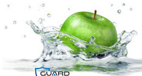
Green Apple Splash