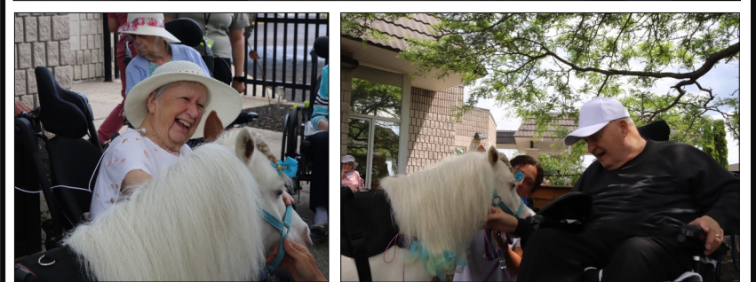
Residents enjoyed time with Rambo the pony in June.