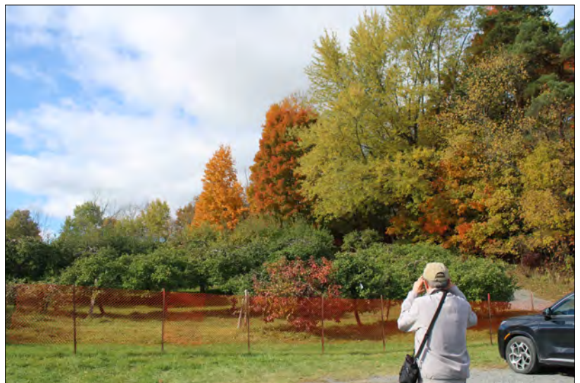
Ernie enjoying photography on a fall excursion.