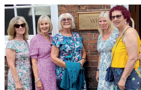
New Members visit White Friars

On a lovely July day, our CFWI Advisers from the Organisation and Membership Sub-committee were delighted to warmly welcome fifty-two new members from across the Federation to WI House in Chester. Having chosen either a morning or afternoon session, members got to know each other over refreshments of scones, jam and cream (or cream and jam!), before learning about the history of the WI, its structures and how it operates. Between them, the CFWI Advisers explained how, as new members, they can find out about what is happening within the WI, the activities and opportunities on offer, as well as information about resolutions and campaigns, so that they can hopefully become more involved at local, federation and even national levels. There was much discussion, happy chatter and laughter as many members completed the event with a guided tour of WI House before leaving with a CFWI 'goody-bag' and the promise to return to Chester for future events.