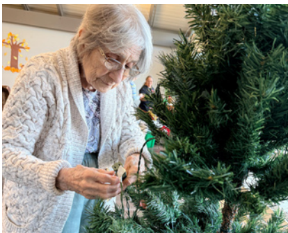
DECORATING THE TREE!