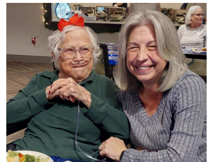
SPECIAL FAMILY BONDS!