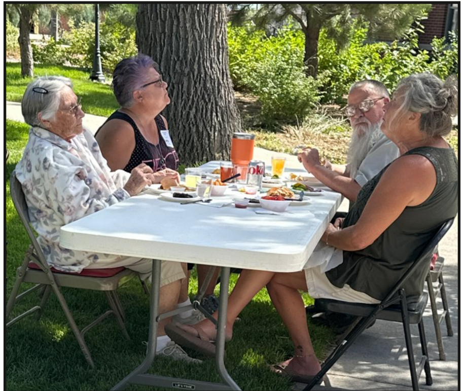
BBQ, DANCING, AND FUN!!