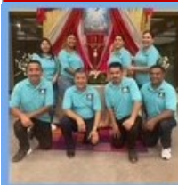
Alavanza Profetas de esperanza