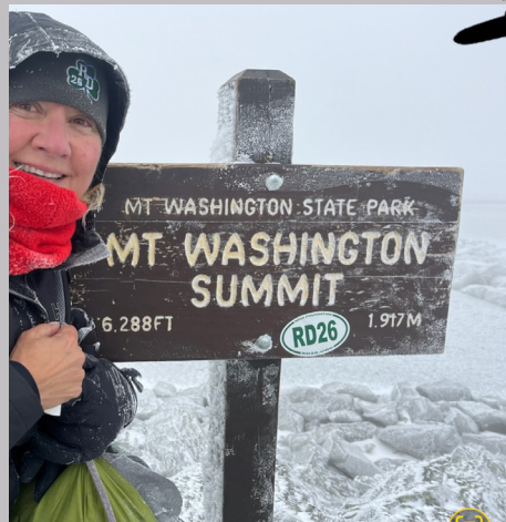
Mount Washington, NH