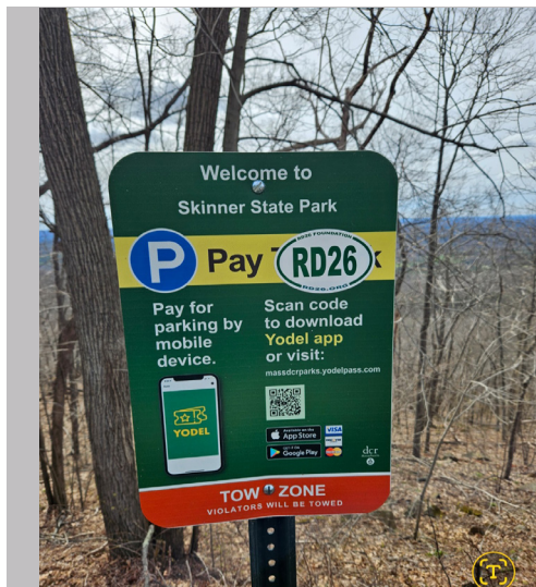
Skinner Skate Park, MA