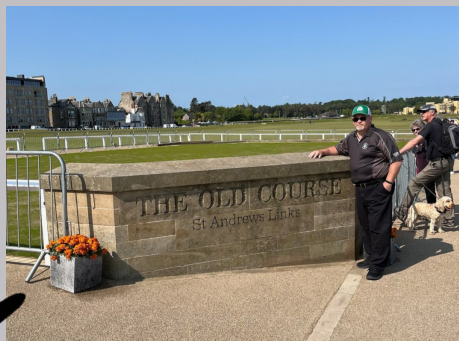
📍 St. Andrews, Scotland