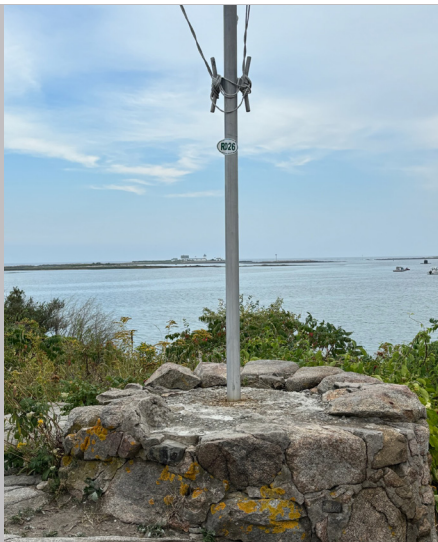
📍 Bickford Island, ME