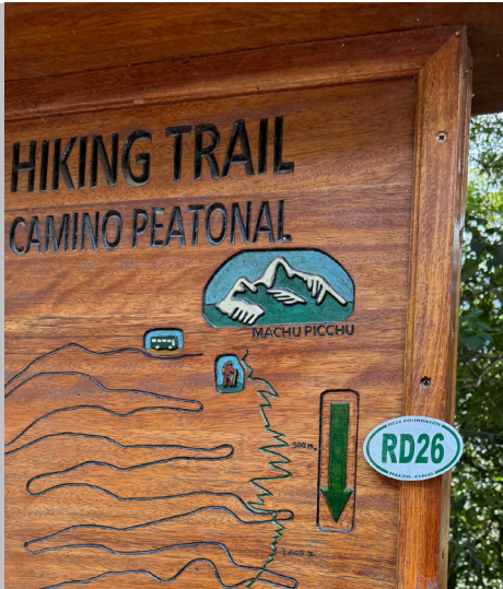
📍 Machu Picchu, Peru