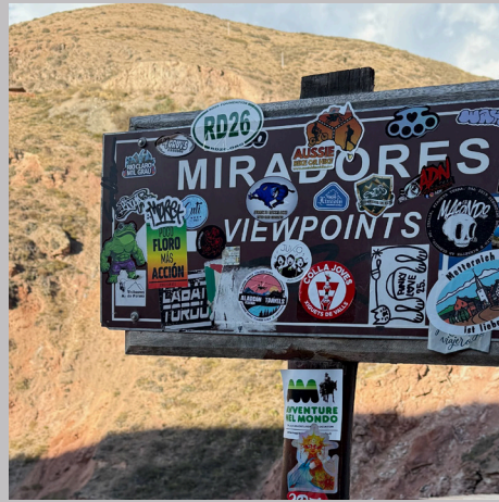
📍 Border of Argentina