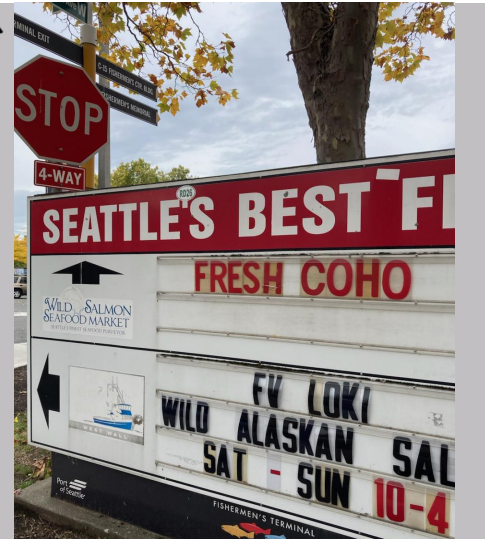
📍 Seattle, WA