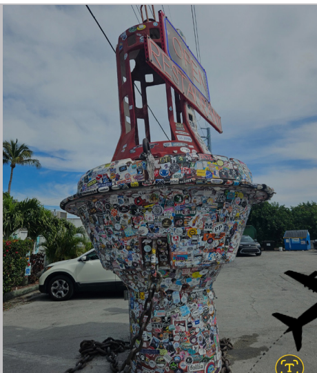
📍 Islamorada Island, FL