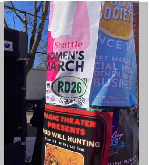
📍 Seattle, WA