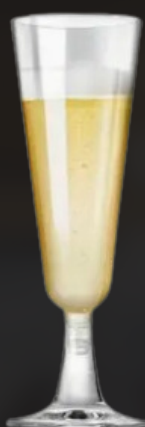
Stemmed Champagne Flutes