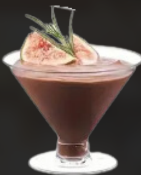
Short Stem Martini