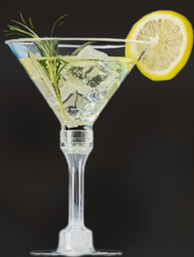
Long Stem Martini