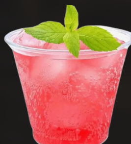
9 oz Plastic Cup