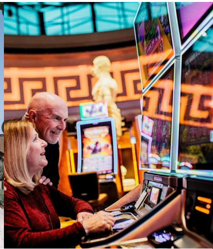
Gaming at Caesars Windsor Casino