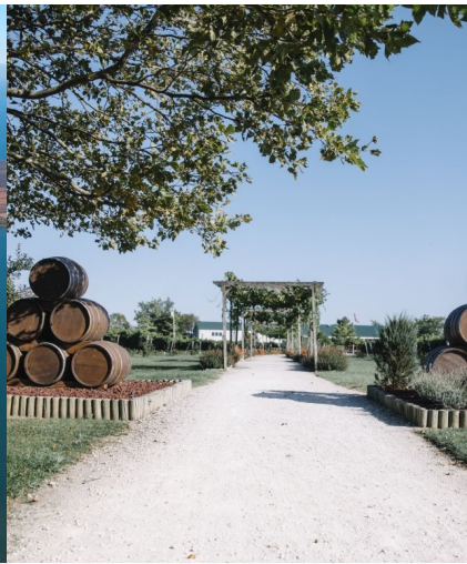
Pelee Island Winery Pavillion