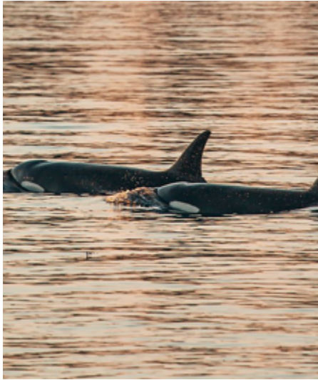
Whale Watching