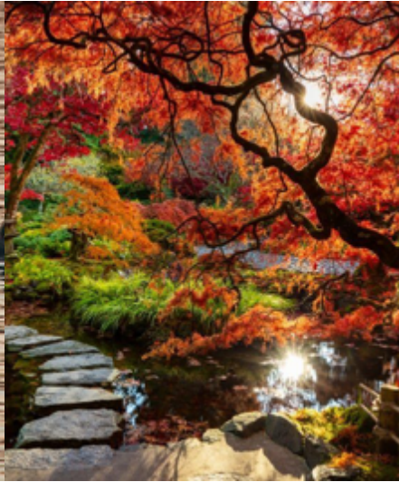
Butchart Japanese Gardens in the fall