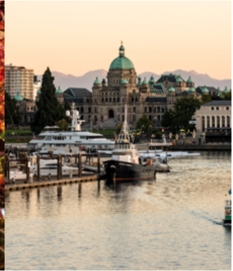
Harbour with Parliament Buildings