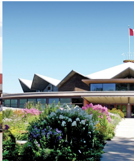
Stratford Festival Theatre