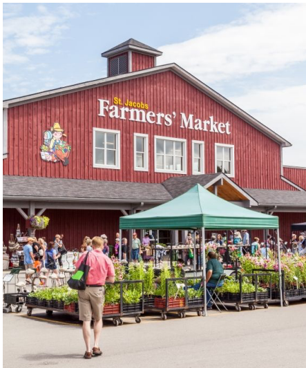
St. Jacobs Farmers' Market

Dive deeper into the Mennonite community with a backroads tour, led by a local guide.