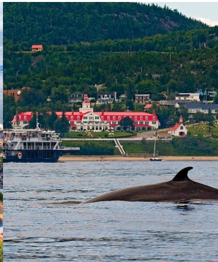
Baie de Tadoussac