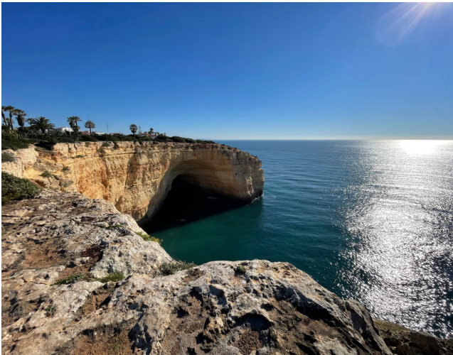
Seven Hanging Valleys

Hike the Algarve: Trails, Coastlines & Culture