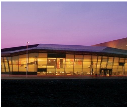
Canadian War Museum