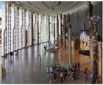
Canadian Museum of History