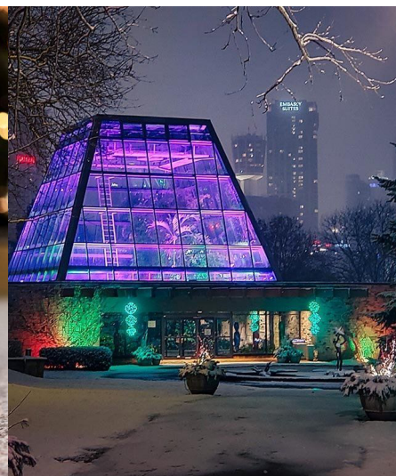
Floral Showhouse