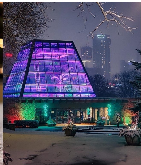
Floral Showhouse