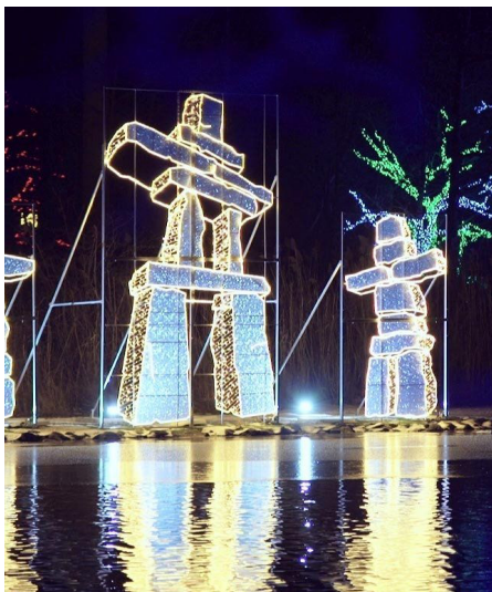
Winter Festival of Lights

From accommodations and transportation to planned experiences and meals, every detail is organized for you. Travel comfortably knowing your itinerary is fully coordinated, allowing you to simply enjoy the journey, connect with fellow travellers, and make the most of every moment.