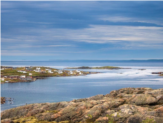
Red Bay, Labrador

Travel to the "Big Land" Labrador and spend two extra days exploring "The Rock"