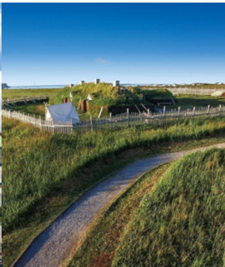
L’Anse aux Meadows