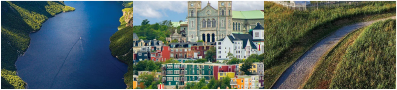
Western Brook Pond Gorge