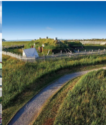
L'Anse aux Meadows