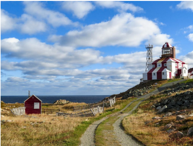
Cape Bonavista Lighthouse

Experience The Rock — Rich in Story, Warm in Spirit