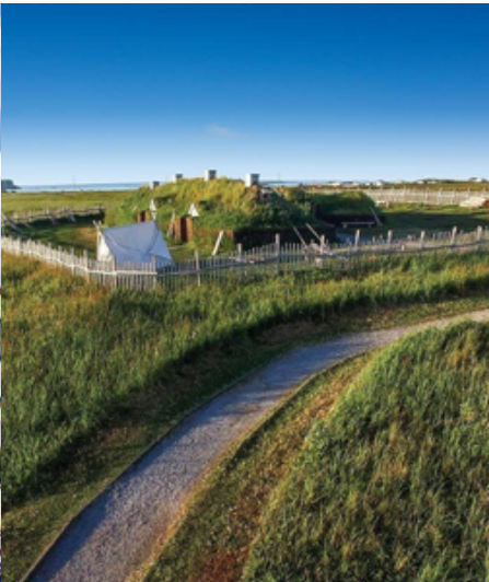
L’Anse aux Meadows