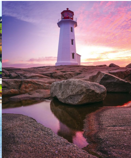
Peggy's Cove, NS