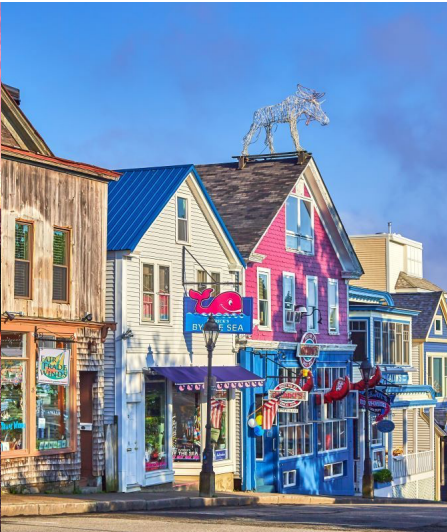
Bar Harbour, ME