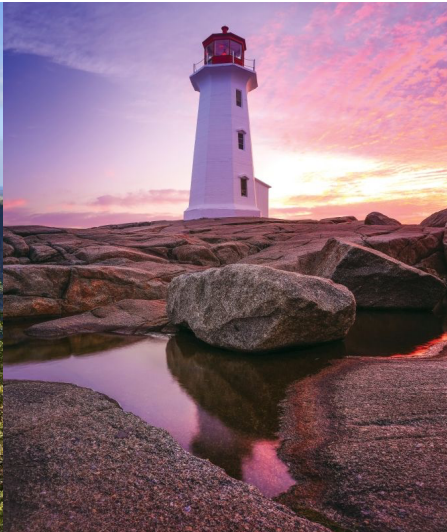
Peggy's Cove, NS