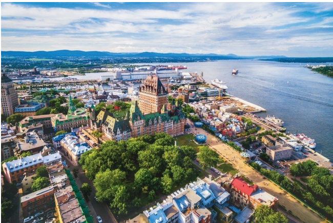
Québec City Harbour