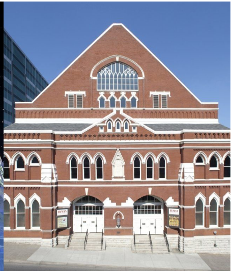
The Ryman Auditorium