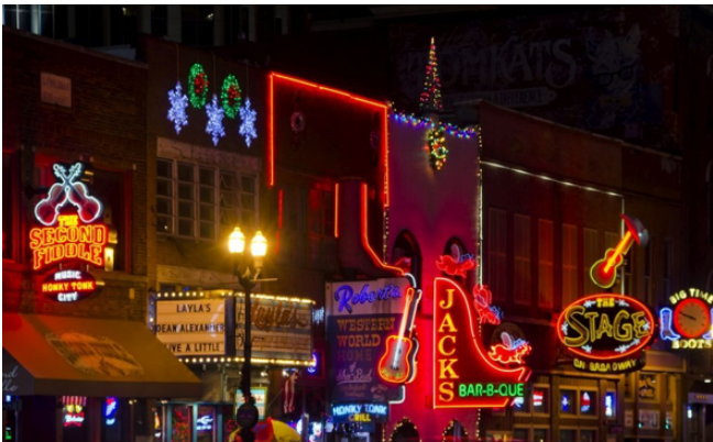
The Festive Honky Tonks

Have a merry time in Music City – It positively sparkles during the Christmas season!