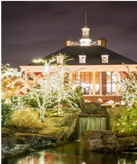
Gaylord Opryland at Christmas

This is "The Show that Made Country Music Famous," and no visit to Nashville is complete without seeing a show at The Grand Ole Opry. What began in 1925 as a one-hour radio “barn dance” has become a star-studded country music tradition and a milestone for every aspiring country artist.