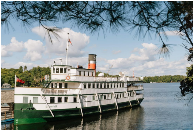
Muskoka Steamship

Step Back in Time and Sail into Muskoka's Charm