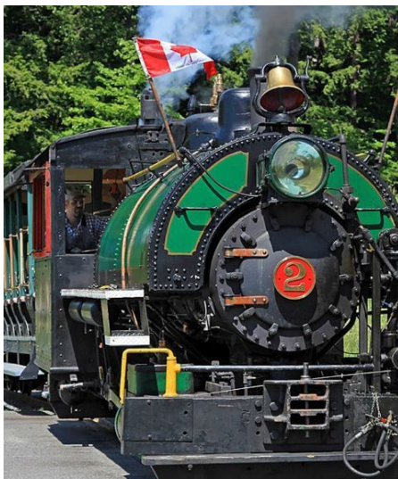
Portage Flyer Train